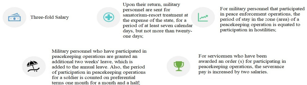
Figure 2. Benefits of participating in operations for peacekeepers

of developing ideas and theories, people living there will prioritize survival. Likewise, global hunger is another key limiting factor, as many of those struggling to survive and starving to death could have become specialists in engineering, space programs, or medicine.